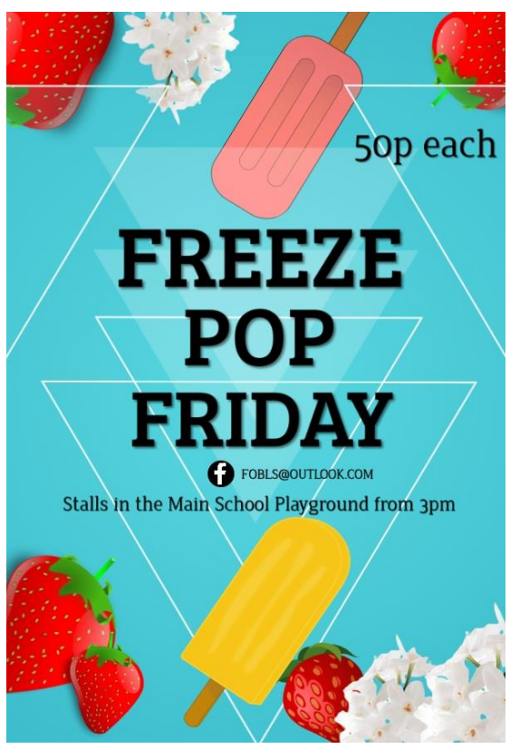
Early Years will be available in EY's