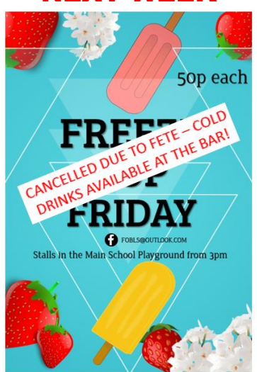
Early Years will be available in EY's